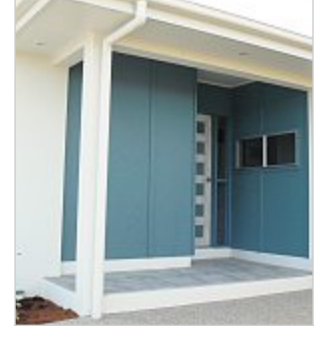
A new house in Montgomery St, Rural View.

The price and payment dreams into reality.