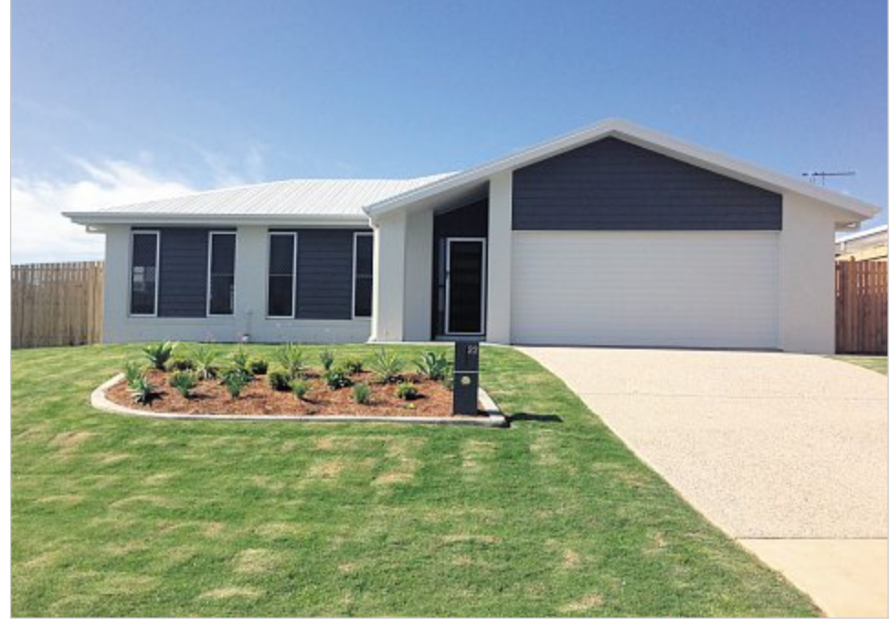
BIG INVESTMENT: Your home could be your biggest asset. This home is in Tamron Dr at Mount Pleasant.

Building is a very personal process. The builder you en-